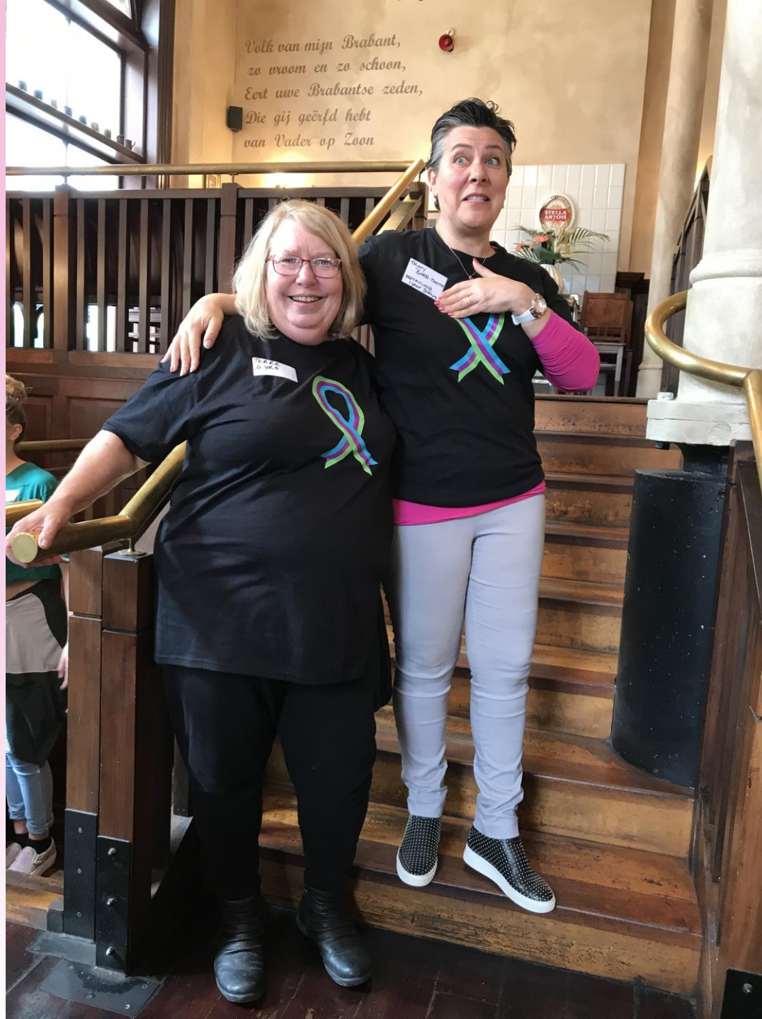
Terre, Ibrance petitioner