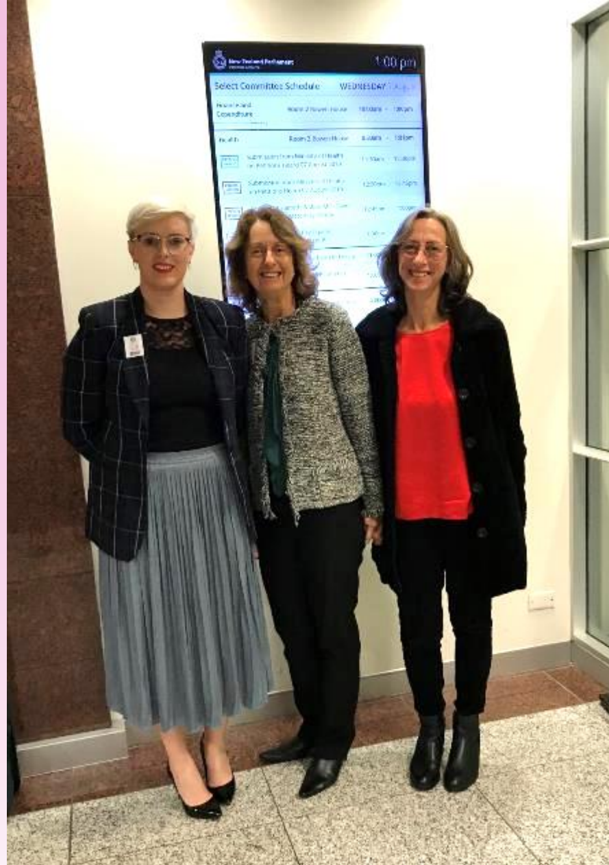
Health Select Committee hearings