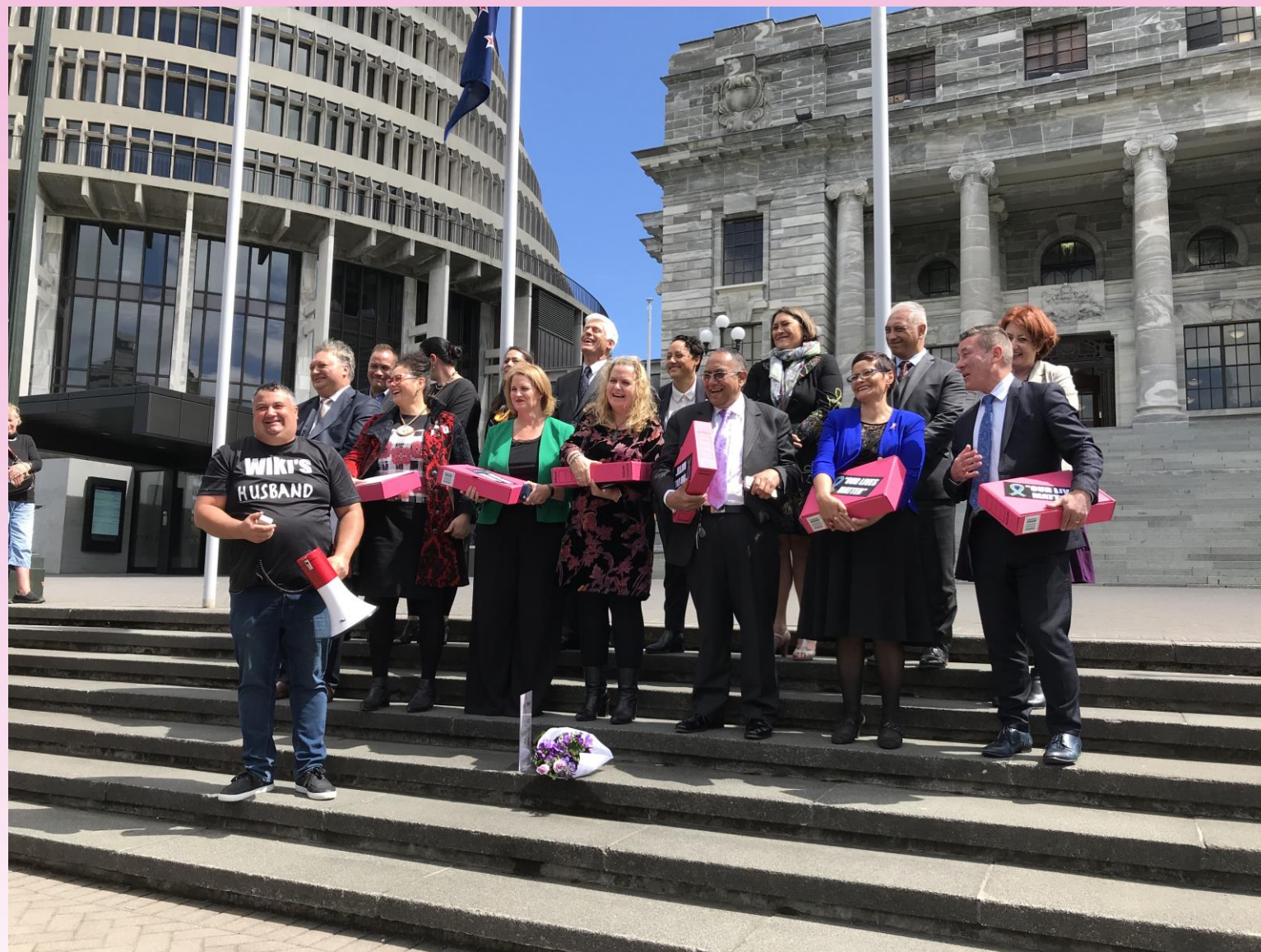
17 MPs accepted Ibrance and Kadcylla petitions